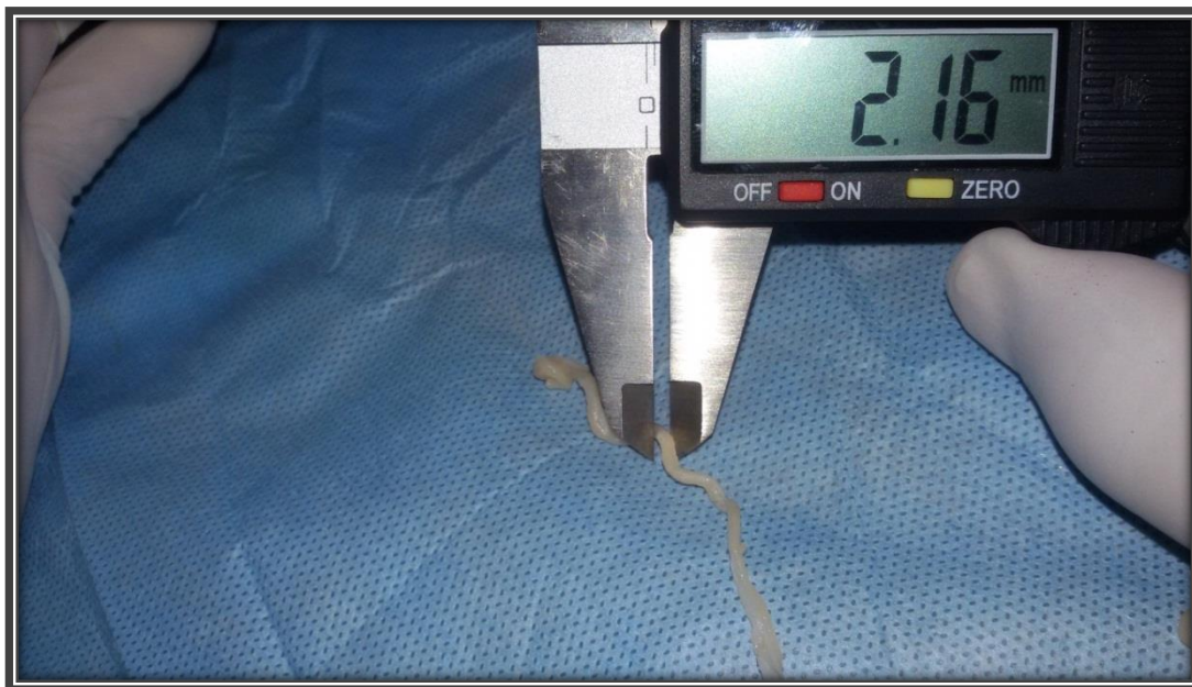
Figure 2. The method of measuring the width of oviduct (external diameter) in goat using digital caliper