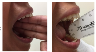
4 raters took these measurements