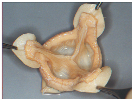
Figure 2. Shelhigh No-React-treated SuperStentless valve (outflow view).

Aortic valve surgery was performed, and homografts, Shelhigh No-React SuperStentless valves (Figure 2), and the No-React BioConduit were the valve substitutes used. Shel-