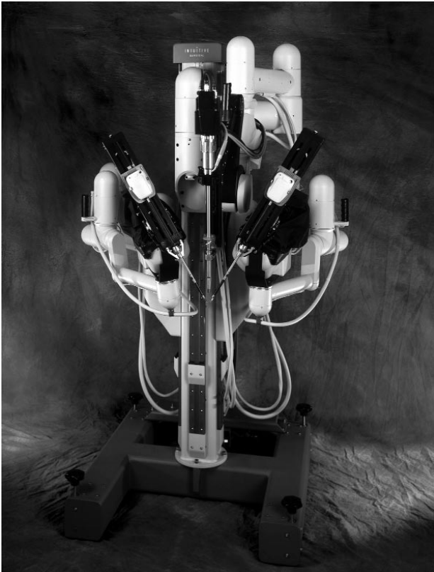
Figure 1. The Da Vinci robotic system.