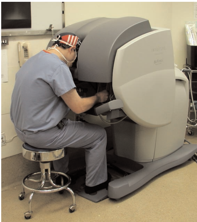
Figure 2. Surgeon seated at console.

site, through which the right and left arms of the robotic system are inserted sequentially under direct videoscopic guidance. These two ports provide access for surgical instruments. Pencil-sized instruments (with tiny, computer-enhanced mechanical wrists) are attached to the robotic arms and provide the dexterity of the surgeon's forearm and wrist at the operative site. The surgeon's movement translates into action by the robot. The robot's arms hold the instruments, bending back and forth, side to side, and rotating in a full circle, resulting in motion with seven degrees of freedom. [Falk 2000b, Kappert 2000].