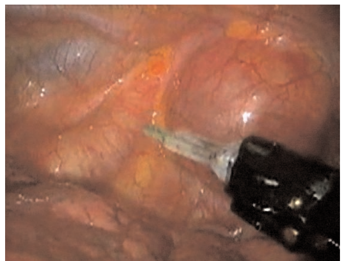
Figure 3. Mediastinal mass and adjacent anatomy.

Technological advancements over the last decade have enabled surgeons to perform minimally invasive surgery