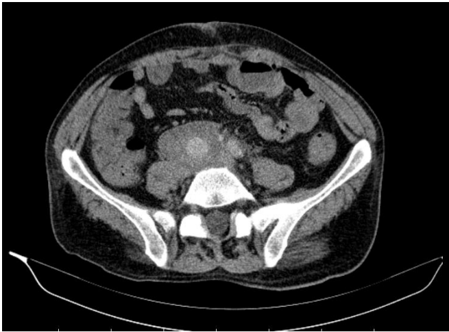
Figure 2. CT angiography demonstrating an endoleak inside the aneurysm two months postoperatively.

risks associated with less blood transfusion. Yet, there is a chance that the real mortality and technical success rates following endovascular repair are not as favorable due to unreported cases [Bernstein 2013]. Furthermore, in the context of aortoiliac aneurysms with spontaneous arteriovenous fistulas, endovascular repair itself is not without problems as it is associated with 42 percent of post-procedural complications, including endoleak, graft thrombosis, graft stenosis, persistent fistula, stent prolapse into the IVC, and persistent aorto-renal fistula [Antoniou 2009]. It may also induce inferior vena cava thrombosis [Bernstein 2013]. Clearly, a failure in endovascular repair would also necessitate a surgical approach.