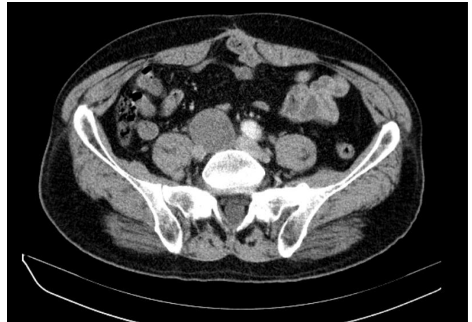
Figure 3. CT angiography with no endoleak one year postoperatively.

Our case includes a 57-year-old male who had 11 cm right iliac artery aneurysm with an arteriovenous fistula (Figure 1).