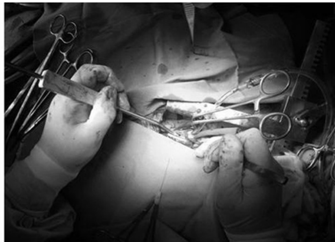
Figure 2. Operative view of the patient during aortic valve replacement.

the cosmetic outcome after minimally invasive procedures is higher than for a standard median sternotomy Bakir 2006. From February 2008 to the present, we successfully performed aortic valve replacement in 6 adult patients (a mechanical prosthesis in all patients) and atrial septal defect repair 10 adult patients (primary repair in 7 patients, a patch in 3) by using a 5-cm skin incision and a key-lock mini-sternotomy. The exposure was excellent in all cases (Figure 2), and conversion to a median sternotomy is easy when necessary. Early postoperative transesophageal echocardiography evaluations revealed a completely patent interatrial septum and a normally functioning aortic prosthesis in all cases. This approach was associated with less postoperative pain and a better cosmetic outcome. The cardiopulmonary bypass, cross-clamping, and operative times were comparable to those of a standard median sternotomy. None of the patients in these cases experienced a sternal or femoral wound-healing problem.