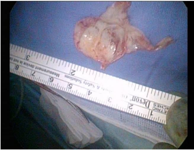
Figure 2. The dimension of the cystic mass measured 3.4 cm × 1.5 cm × 1 cm.

The patient was discharged from the hospital on postoperative day 8 after an uneventful postoperative course and maintained on anticoagulation for three months. Follow-up TTE at three months revealed no recurrence of any intracardiac mass and a competent mitral valve.