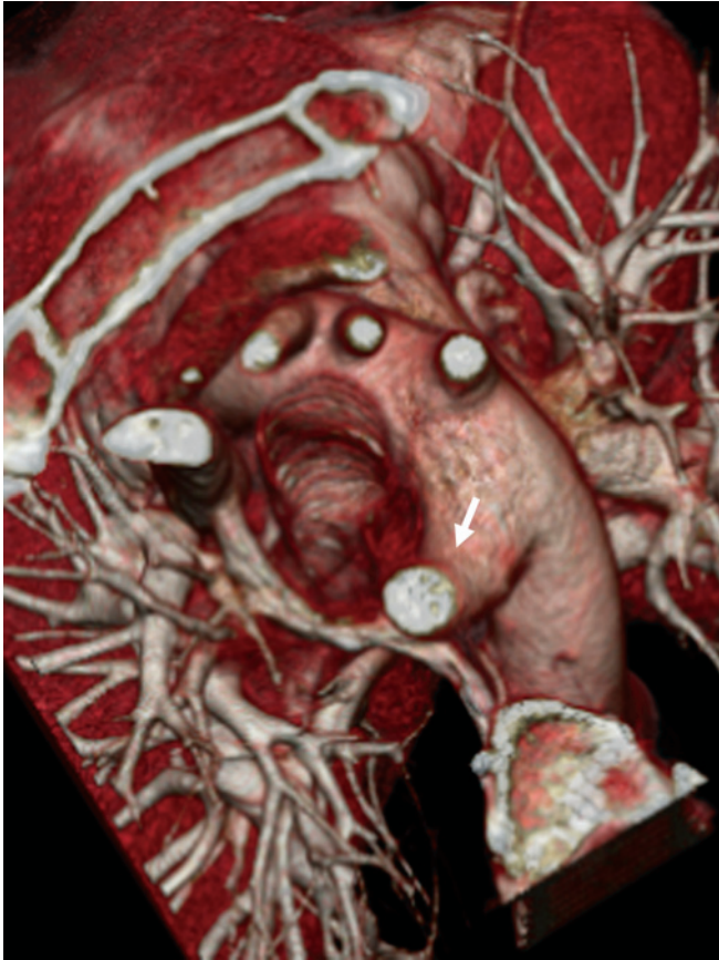
Figure 1. 3D reconstruction of a preoperative multislice CT scan showing an aberrant right subclavian artery coming as first branch of the descending thoracic aorta (i.e., arteria lusoria, marked by a white arrow).