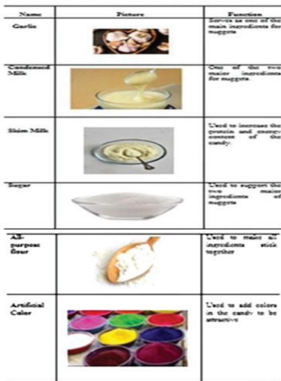
Table 2: Ingredient in Developing Garlic Candy

Likert scale was used in the evaluation sheet for it is the most widely used approach in scaling responses. Evaluation sheet contains different attributes such as size, color, taste and smell. The score was then used to identify the specific quality –highly acceptable (5), acceptable (4), average (3), Unacceptable (2), and highly unacceptable (1) respectively. In responding to a Likert Scale, the respondents specified if the formula Weighted mean is used in the study to determine the interpretation of the result. The responses were given equivalent weighted values which 1 as the lowest and 5 as the highest value. The corresponding verbal interpretations for each value were also provided.