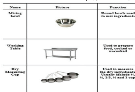
Table 1: Materials Used in Developing Garlic Candy

The researchers came up with the suitable ingredients and equipment in making garlic candy after reading related literatures on the importance of garlic in treating hypertension and obtaining ample information on the production of related products. The materials and equipment used by the researchers were identified to be appropriate to the development of garlic candy. The following materials are: