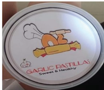
Figure 3: shows the overall cover of the packaging

with its name and the words “Sweet & Healthy” to emphasize its main purpose of not just satisfying the sweet tooth of consumers but definitely improving their health conditions