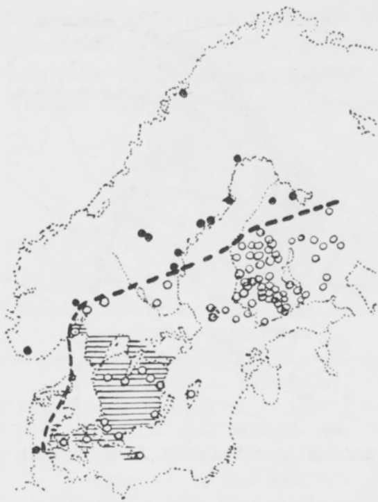
Fig. 1. Limit of the epidemic area of black stem rust in Northern Europe in summer 1951. The lines = the centre of the epidemic, white dots = rust has occurred, and black dots = no epidemic (according to (5) and own information).