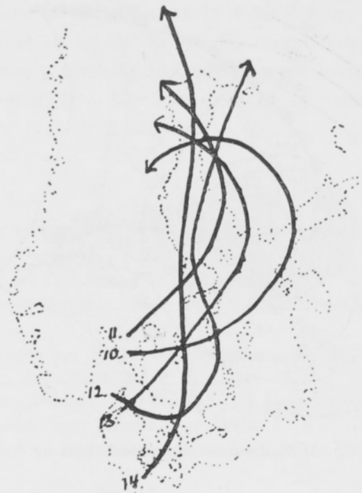
Fig. 2. Winds in the upper air calculated with the aid of gradient winds for the Baltic Sea area, August 10—14, 1951.

probably due to the fact that west winds were blowing over the North Sea, preventing the spores from being borne westwards. In fact, in Denmark the epidemic was most pronounced in the eastern regions of the country (2). The run of the epidemic in Norway also shows that southwest and south winds had carried the spores in a northeasterly direction.